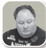
Greg Raymer is the 2004 WSOP world champion, winner of numerous major titles, and has more than $7 million in earnings. He is the author of "FossilMan's Winning Tournament Strategies," available from D&B Publishing, Amazon, and other retailers. He is sponsored by Blue Shark Optics,

Have fun, play smart, and look for those squeeze opportunities! ♠