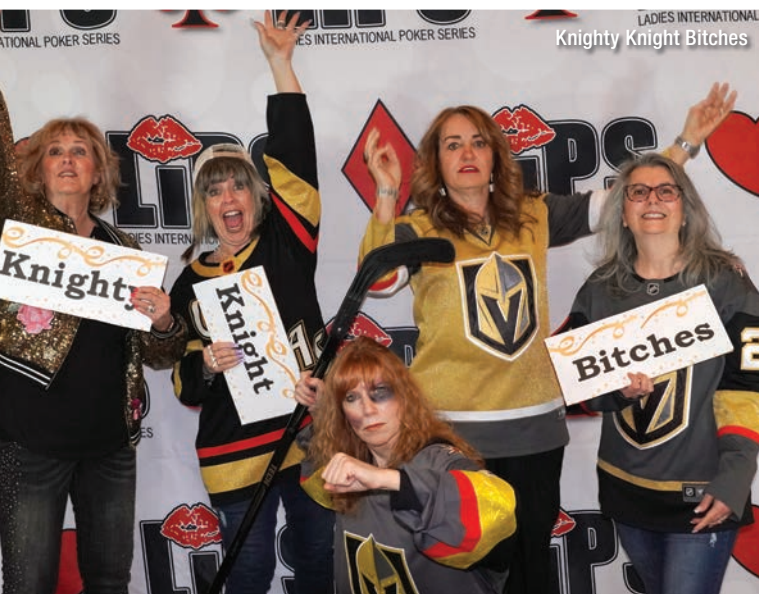
LADIES INTERNATIONAL POKER SERIES Knighty Knight Bitches