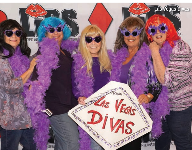
Las Vegas Divas