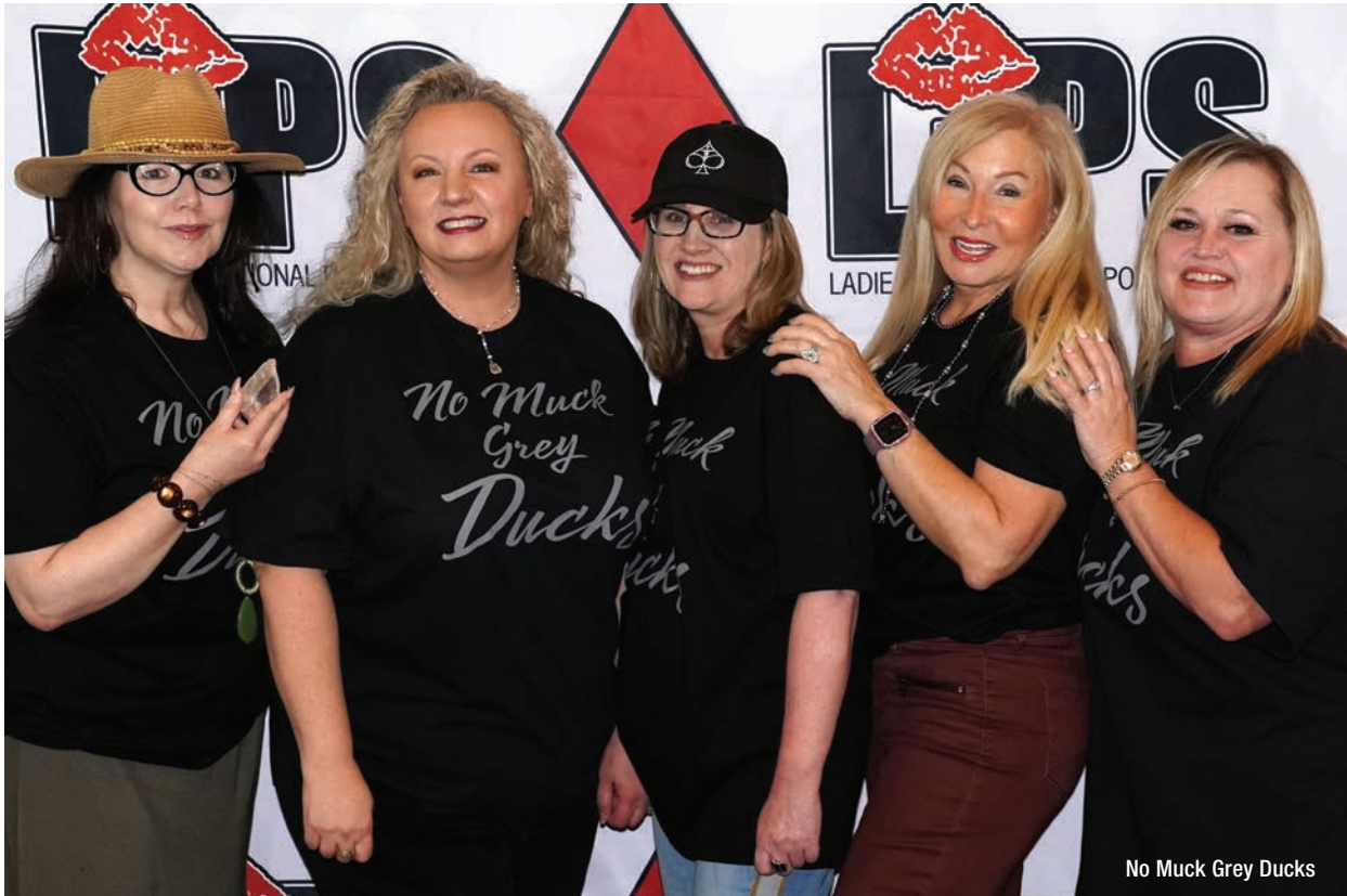
No Muck Grey Ducks